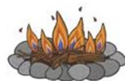
3' X 3' Max