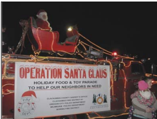
Santa and his sleigh during one of the neighborhood parades.

Operation Santa Claus closes out the 2011 Operation by helping 424 Clackamas County residents, 13 non-profit organizations and 1,109 children with food, toys, clothing, toiletries, and pet food.