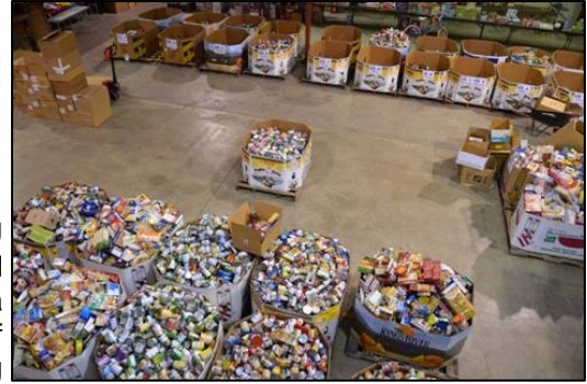
2011 Operation Santa Claus warehouse

Toys pile up at the Operation Santa Claus warehouse.