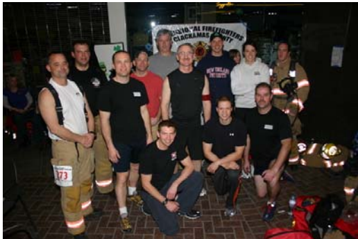
2010 Clackamas Fire Stairclimb Team

The team also would like to pass on its appreciation to the bottle and pack helpers at Stations 2 and 10, Ryan Heitschmidt for driving the van with all the gear to Seattle and to Matt Kilgras who changed packs and bottles on the 40th floor all day. There were 32 team members and family that enjoyed a seafood extravaganza at the Crab Pot following the climb.